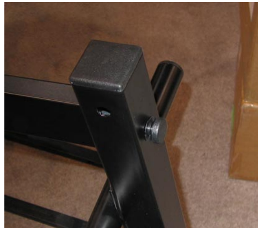
Insert the end caps, completing the frame.