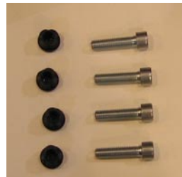
Frame screw kit.