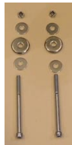
Power supply screw kit