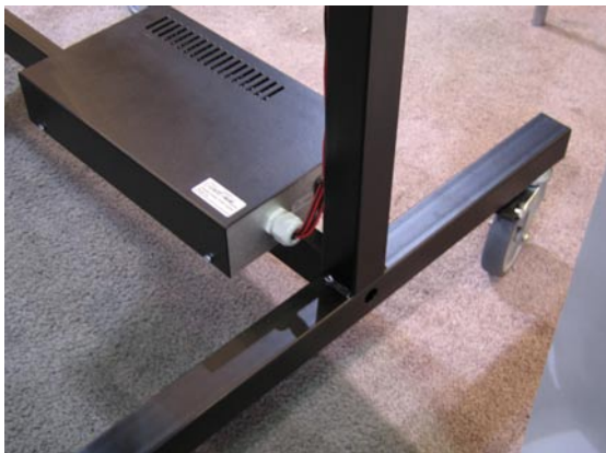
Power supply ready with top cover

After testing the CT-10 is ready for use. When placing the Delegate Unit's in their holders, make sure they are standing flat on the CH-103 surface, this to ensure proper contact to the charger pins.