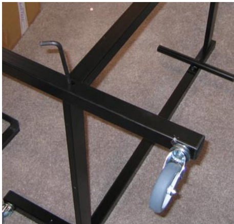
Use hexkey tool to fasten the other side,