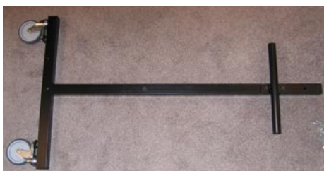
Frame side (shows a handle, no longer included)

Start with fastening the two frame beams to one of the frame sides.