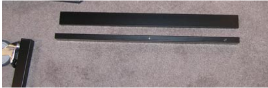
Two beams, beam with screw holes should be the lower beam.