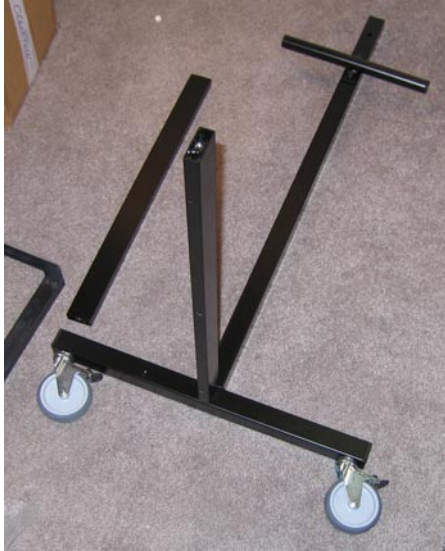
Fasten beam with screw holes low.