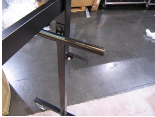
Second from top level, only one side of frame has a 103.

Mount bracket(s) in the order: Screw, washer, bracket, frame, (bracket), washer and locking nut.