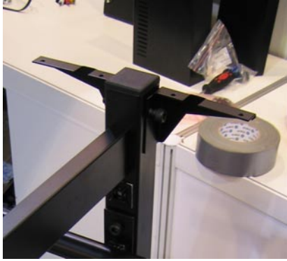
Top level, 103's mounted on both sides of the frame.